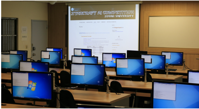
Fig. 5. The Tournament Manager Software running in a computer lab for the CIG competition, which distributes bot games to multiple machines.

vulnerable to the human ability to quickly identify bot patterns and behavior, and exploit this quickly during a match. For example, one human player during a human vs. machine match noted that one bot unit would chase his Zergling when it got close to the bots' units, and proceeded to run the Zergling next to the bot army, and then lead the bot on a wild goose chase throughout the entire map. The entire time, the bot may have been reasoning that its army could win the fight against the single Zergling unit, while not realizing that the human was just buying time until its army was ready for the final attack. This also illustrates one of the biggest challenges in all of artificial intelligence: understanding the long term effects of actions which have delayed rewards. An expert human is able to quickly understand that they are being exploited in such a way, and that it will have negative effects down the road, and is able to stop the behavior. This long-term vision that is so intuitive to humans remains a problem for current RTS AI.