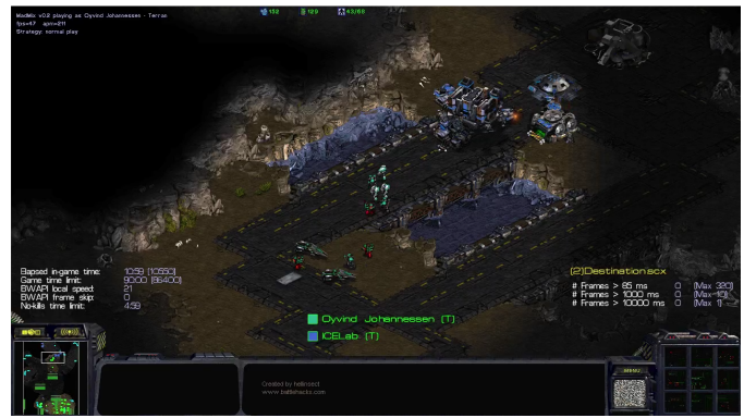
Fig. 1. SSCAIT live stream running in HD resolution and controlled by the custom observer script [9].

The activity of bot programmers and the general public surrounding SSCAIT has grown considerably over the course